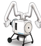
FilterBox Hygiene Twin