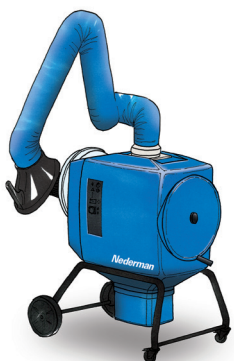
FilterBox 12 A With automatic filter cleaning for heavier dust and fume applications

FilterBox is also suitable for stainless steel welding fumes (>30% chromium content) and fulfills OSHA demands for Chrome (VI).